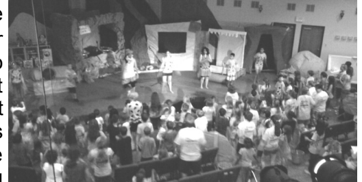
Staff using Flintstones theme to teach creation

So, does it really matter how we teach the Bible's history? We believe it does. The feedback we get from those who have had their faith strengthened and more importantly, those who have begun to see the need for the Savior in their lives, has confirmed the truth that the history of mankind, our origins and our destiny is one of the most vital teachings the Church as a whole should be incorporating into its discipleship programs. The tools and resources are readily available to set up such teaching programs. The time to begin teaching young people is now, not when they become MIA from our churches.