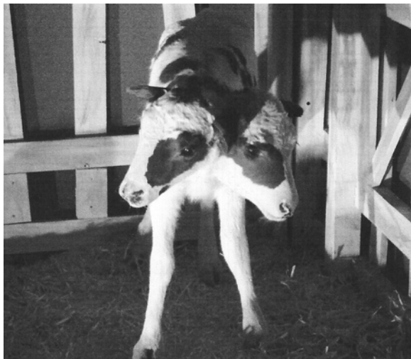
Picture taken at Ripley's Believe It or Not , Branson, Missouri

A mutation can be defined as a change in a living organism's genetic or physical structure. Below is an example of a mutation—a calf born with two heads.